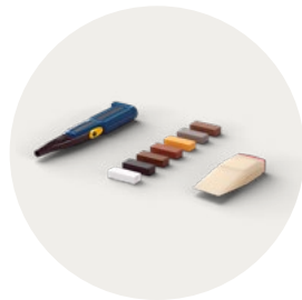
REPAIR KIT PGREPAIR