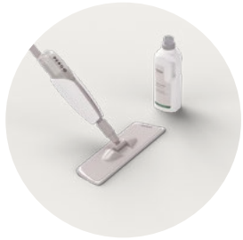
CLEANING KIT PGSPRAYKIT